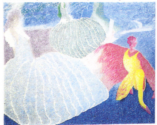
Irving Marcus: Dance of the Snails , 1999, oil on canvas, 42 by 56 inches; at Joseph Chowning.

The wayward, curvy shapes invite association as they resist outright recognition. In Ghost of Chance , a pale red form on a matte gray field looks like a mutant motif from a Paul Feeley painting, but it also resembles a